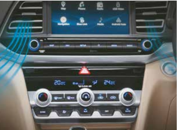
Dual Zone FATC with Cluster Ionizer