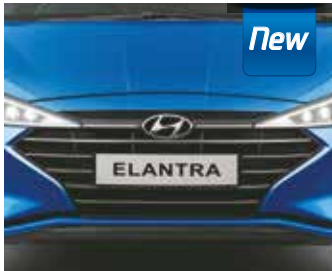
Dominant Front Grille Design