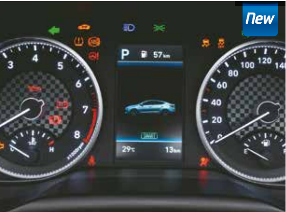
Instrument Cluster with Colored Multi Information Display