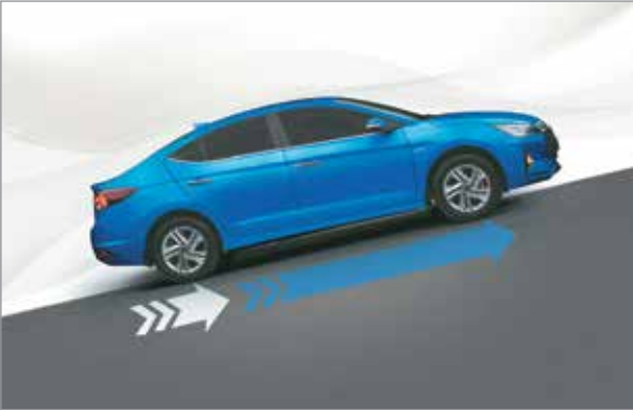
Hill Assist Control

Burglar Alarm | Speed Sensing Auto Door Lock | Strong Body Structure with AHSS