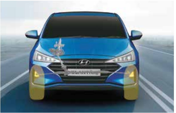
Vehicle Stability Management