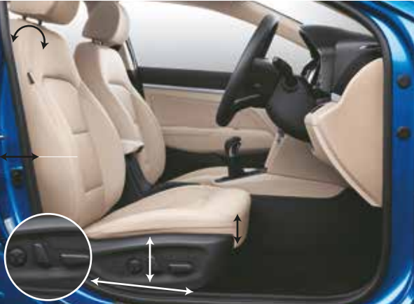
10 Way Adjustable Power Driver Seat with Electric Lumbar Support