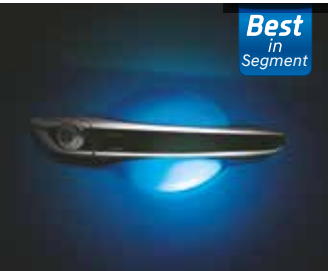
Chrome Door Handles with Pocket Light