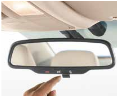
IRVM with Blue Link