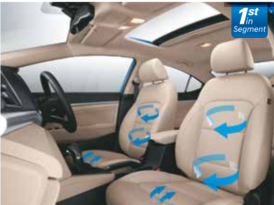
Front Ventilated Seats