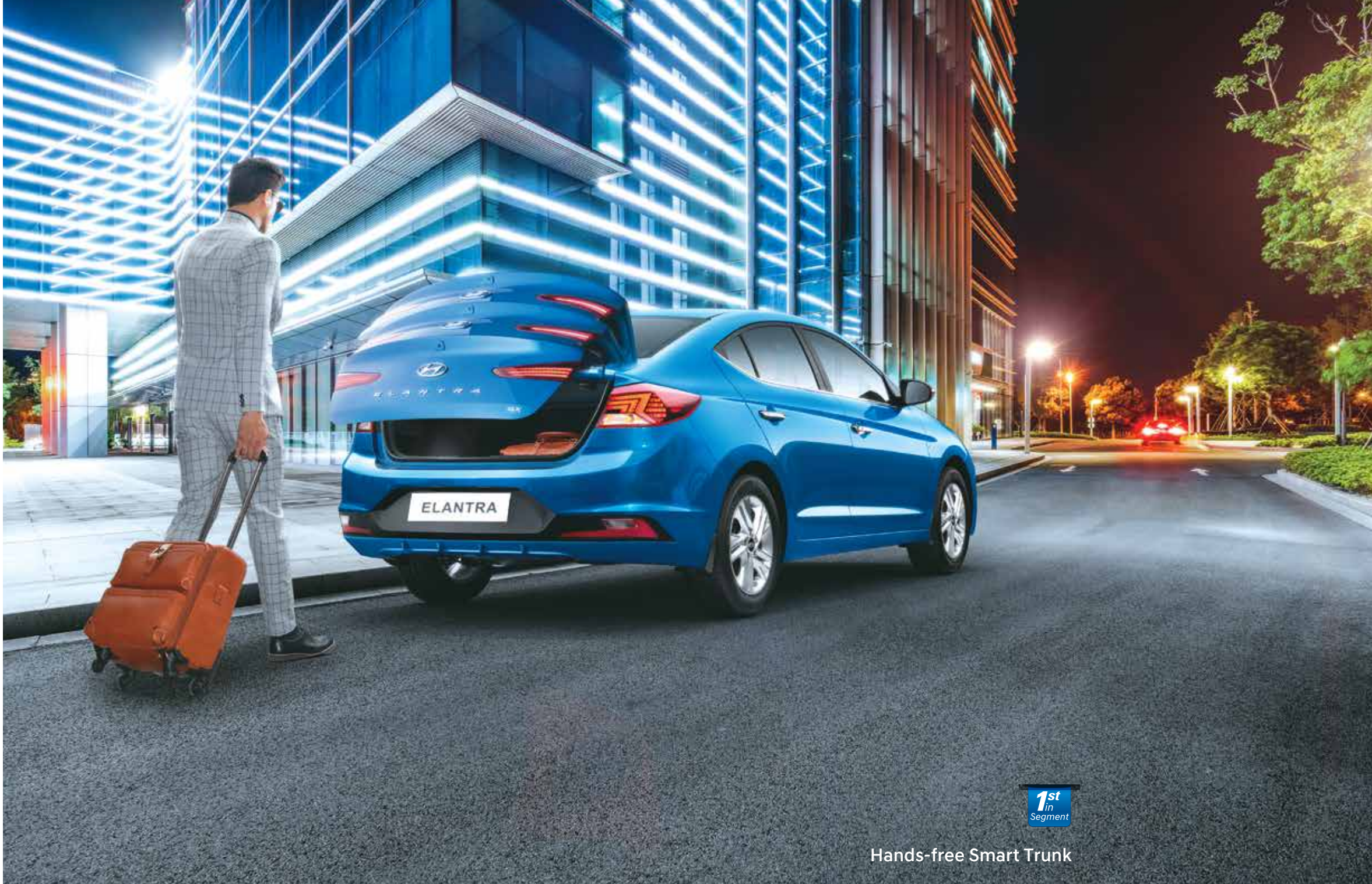
Hands-free Smart Trunk