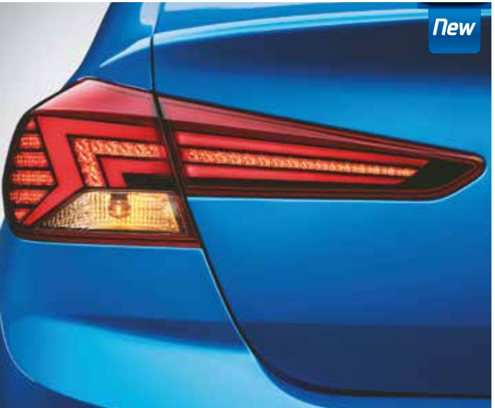
Sporty Rear Combination LED Tail Lamps