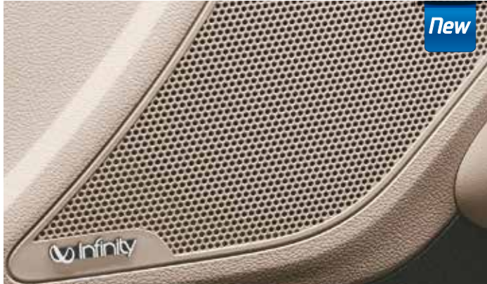
Premium Infinity Sound System with Door Speakers, Centre Speaker, Tweeters, Amplifier, Sub-Woofer