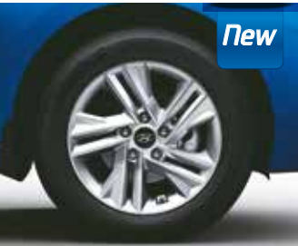
Stylish R16 Alloy Wheels