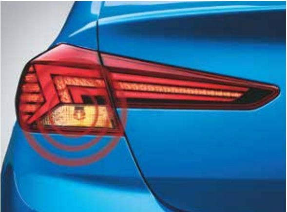
Emergency Stop Signal