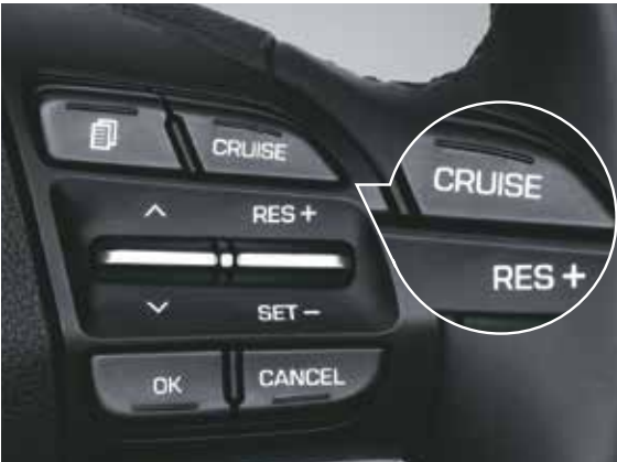
Auto Cruise Control