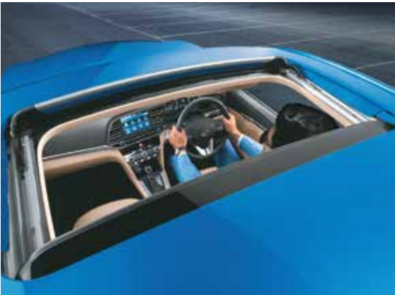
Smart Electric Sunroof

Rear AC Vents | Smart Key with Push Button Start Stop | Tilt and Telescopic Steering | USB Charger