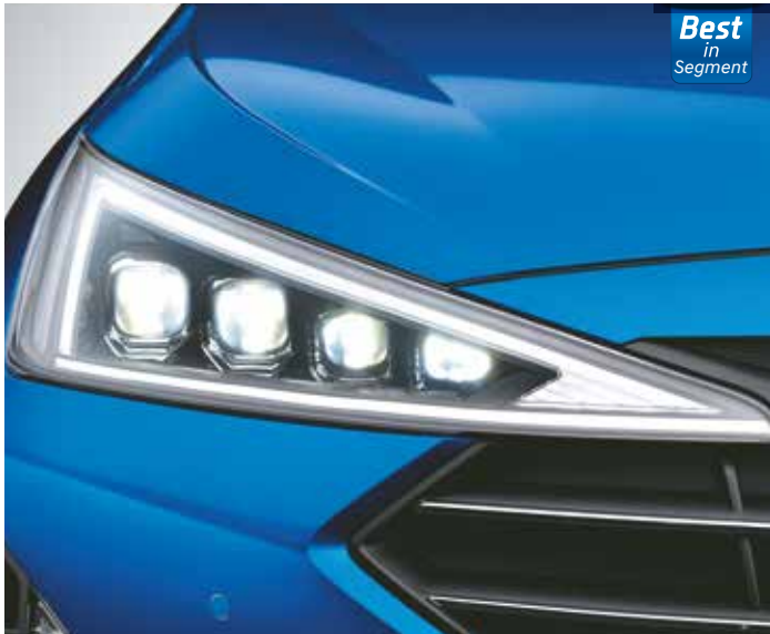
Dynamic LED Quad Projector Headlamps with LED DRLs

Shark Fin Antenna | New Front Bumper Design