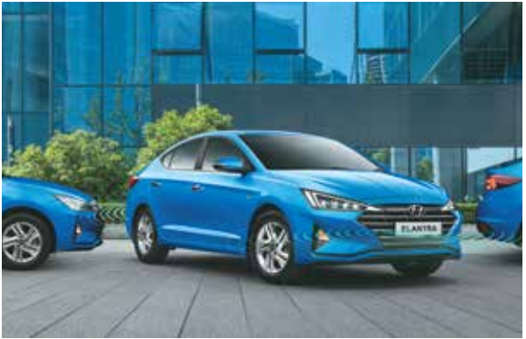
Front & Rear Parking Sensors with Rear Camera