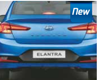
Sporty Two Tone Rear Bumper