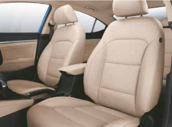
Leather Upholstery* *Leatherette