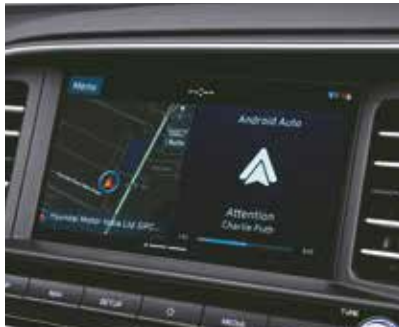
20.32cm HD Smart Touchscreen Infotainment with Navigation and Blue Link