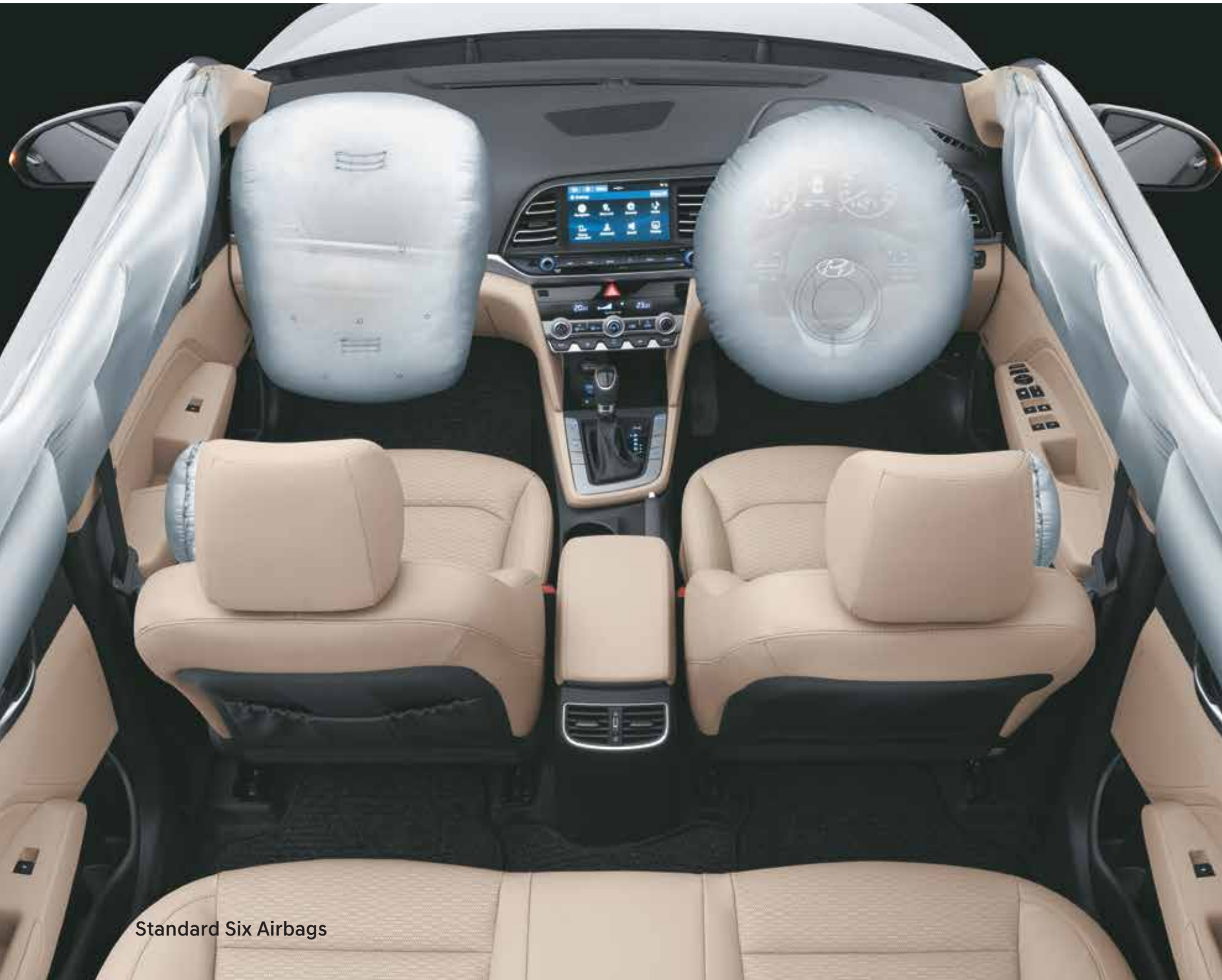
Standard Six Airbags